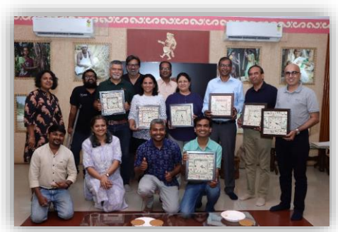
Tata Steel Foundation visit