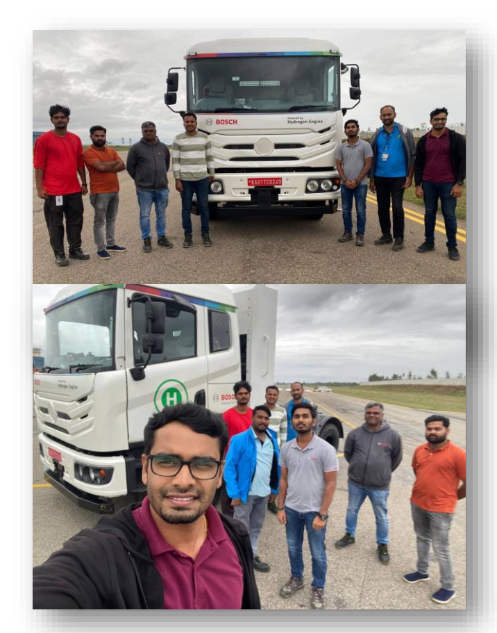
Test Drive at TAAL airstrip