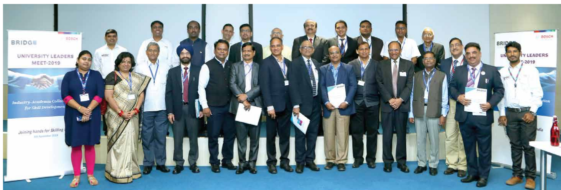
Vice-Chancellors of various Deemed Universities across India at a University Leaders Meet for Skill Development held at Bosch in 2019

“Towards Eliminating Unemployment: One Youth at a Time”