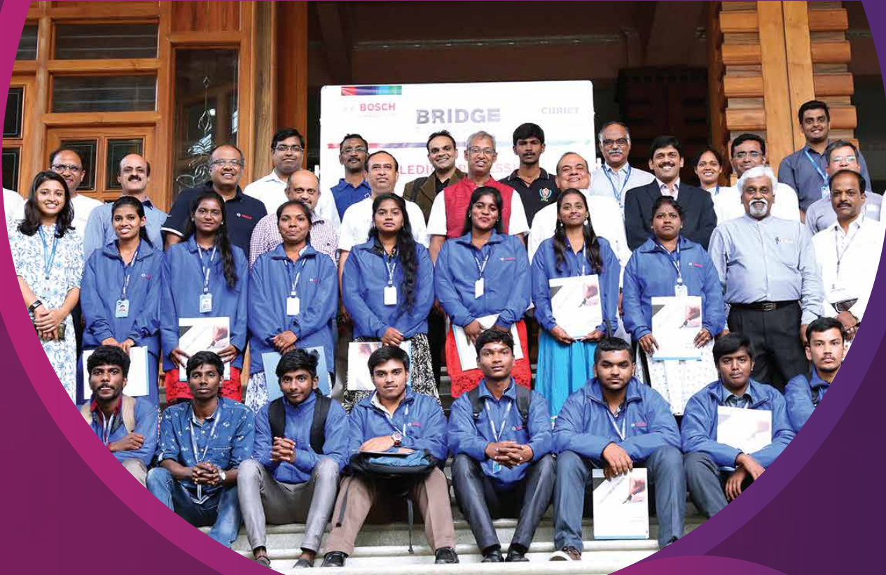
Above: A BRIDGE Valedictory session where students are holding certificates and job offer letters.