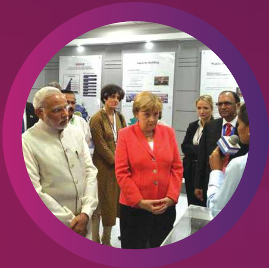
Honourable Prime Minister Shri. Narendra Modi and the German Federal Chancellor, Dr. Angela Merkel listening to few BRIDGE alumni who shared their success stories during the dignitaries' visit to Bosch Vocational Center (BVC) in Bengaluru.