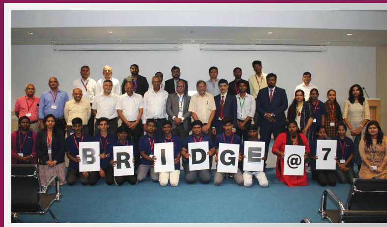
BRIDGE Students, Alumni, Trainers and BRIDGE Center Partners with few Bosch CSR Committee members and Bosch leaders during the BRIDGE program's 7th Anniversary celebration at Bosch, Bengaluru, on 27 th January 2020

“Towards Eliminating Unemployment: One Youth at a Time”