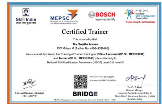
Joint Certification with MEPSC (Skill Sector Council)