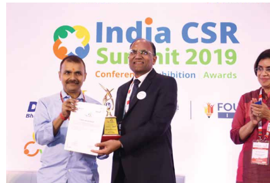
6 th CSR Impact Award