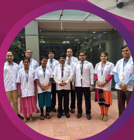
Training of Trainers