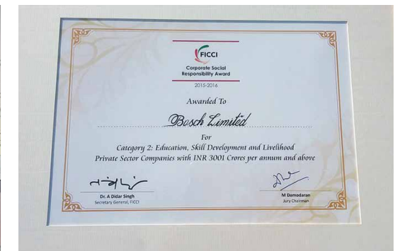
FICCI CSR Award